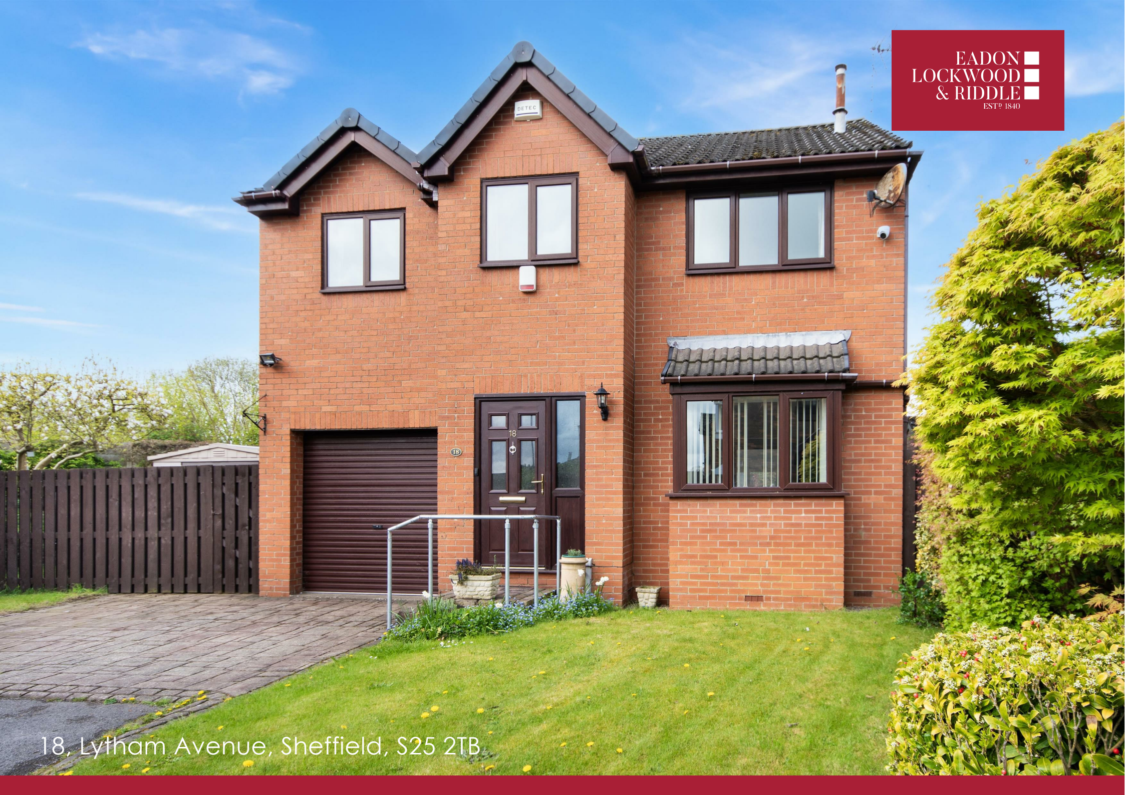
18, Lytham Avenue, Sheffield, S25 2TB